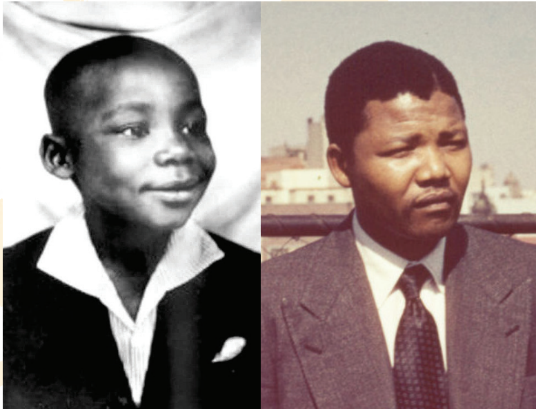
Young Nelson Mandela

Directions: Read the following story, which tells you about the life of Nelson Mandela and how he became such an important figure. Use the story to answer questions.